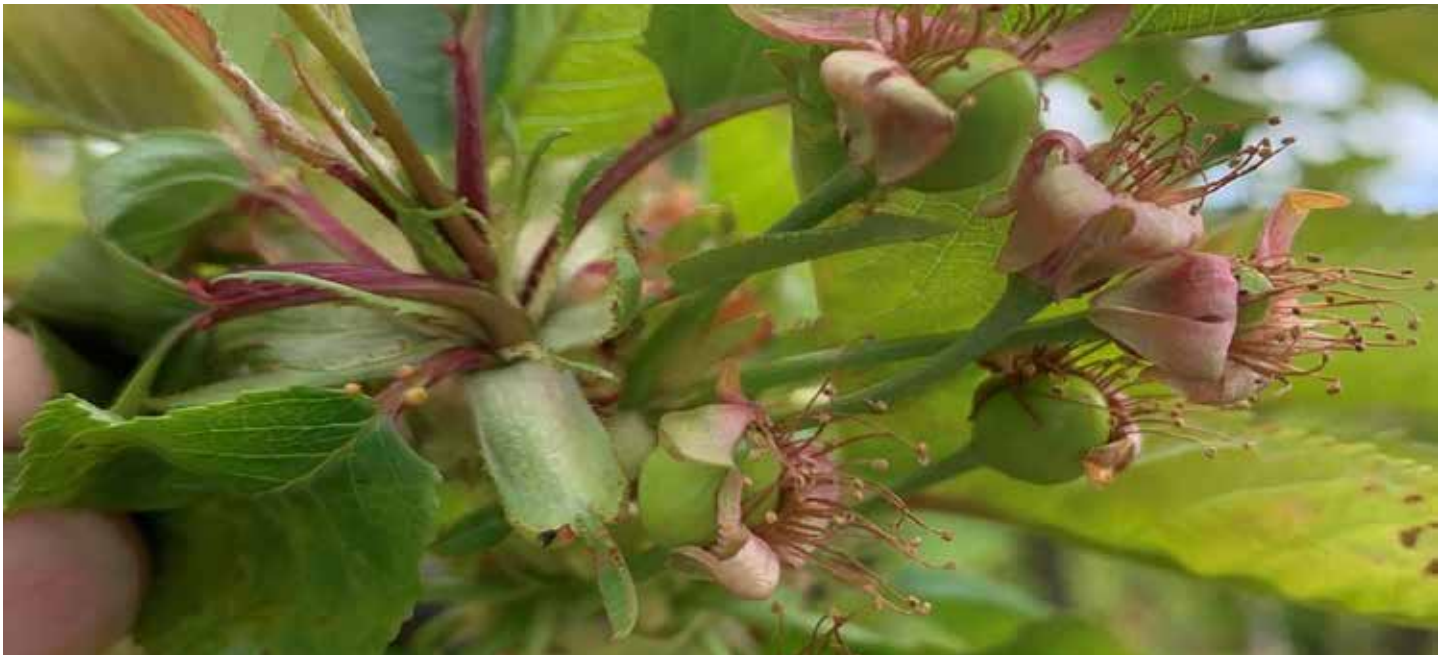
BBCH 72: green ovary surrounded by dying sepal crown, sepals beginning to fall

Use Premio in a program. Begin applications from fruit set onwards, i.e. crop stage BBCH 72: green ovary surrounded by dying sepal crown, sepals beginning to fall. Continue applications at an interval no greater than 10–15 days. Ensure an application is made 14 days prior to harvest. Can be used up to the time of harvest.